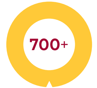
Schaeffer Initiative media mentions