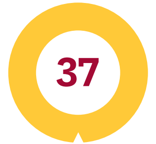
Pieces published by the Schaeffer Initiative on the ACA

Throughout 2017, Schaeffer Initiative scholars produced timely analysis detailing the impacts of each attempt at ACA repeal and replace legislation: