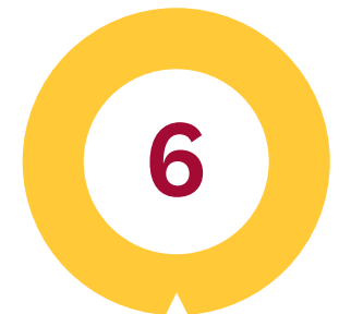
Conferences held in Washington, DC