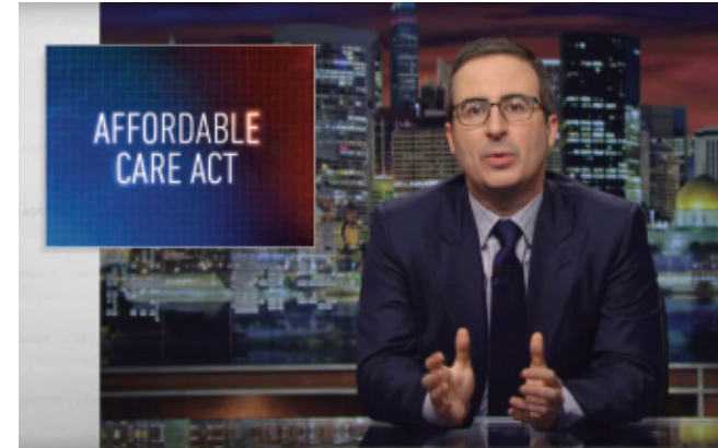
John Oliver cited Schaeffer Initiative research on his popular show, Last Week Tonight .