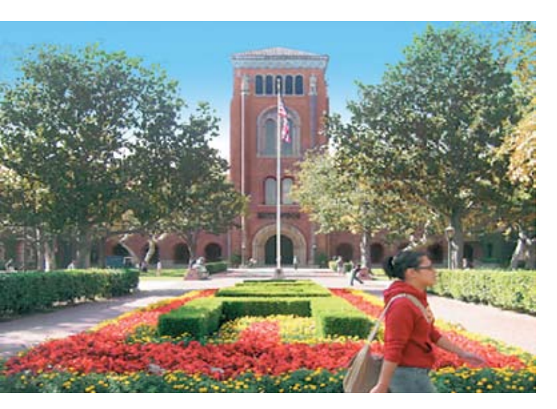
Bovard Auditorium, USC University Park

Using evidence to challenge assumptions, advance policy and reshape health care.