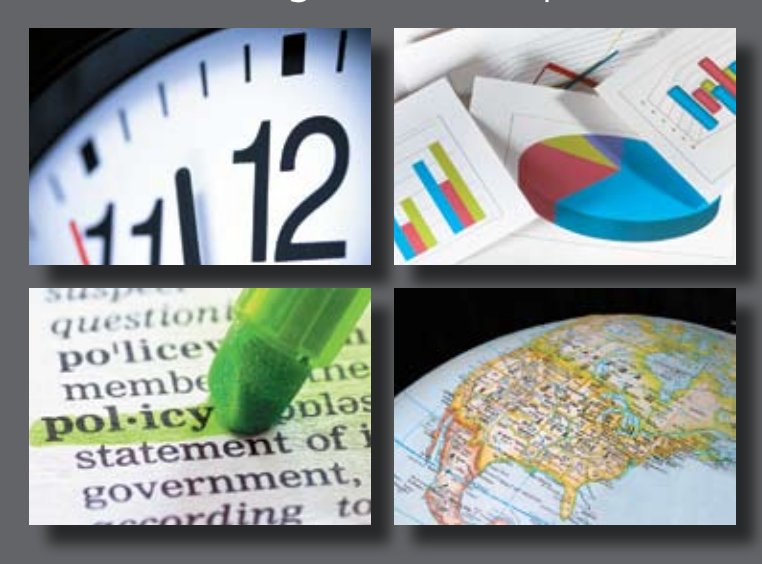
Relevant, Rigorous, Independent