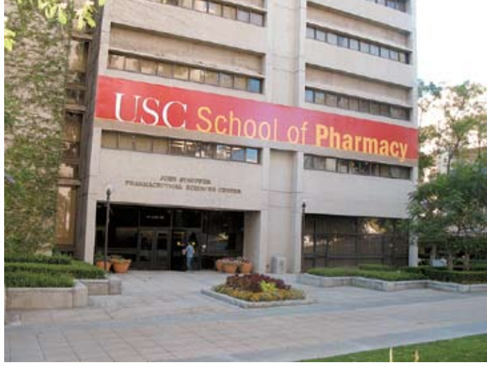
Health Sciences Campus is home to the USC School of Pharmacy